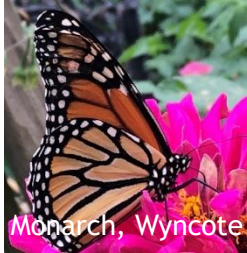
Photo Contest: Submit a photo of your native plant/pollinator garden, rain garden, meadow, bird habitat, or edible garden. Include a brief description of what makes your yard sustainable. Select photos will be displayed at Primex and the Township website and winner will receive a Primex gift card. Yards must be in Cheltenham.